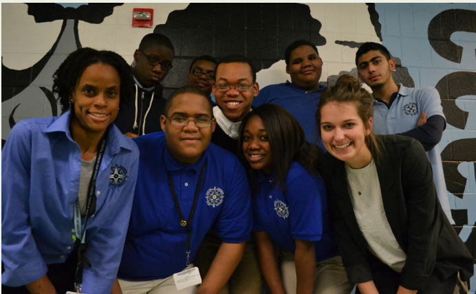
Wide Angle Youth Media's inaugural Attendance and Design Team.

By Wide Angle's Attendance and Design Team